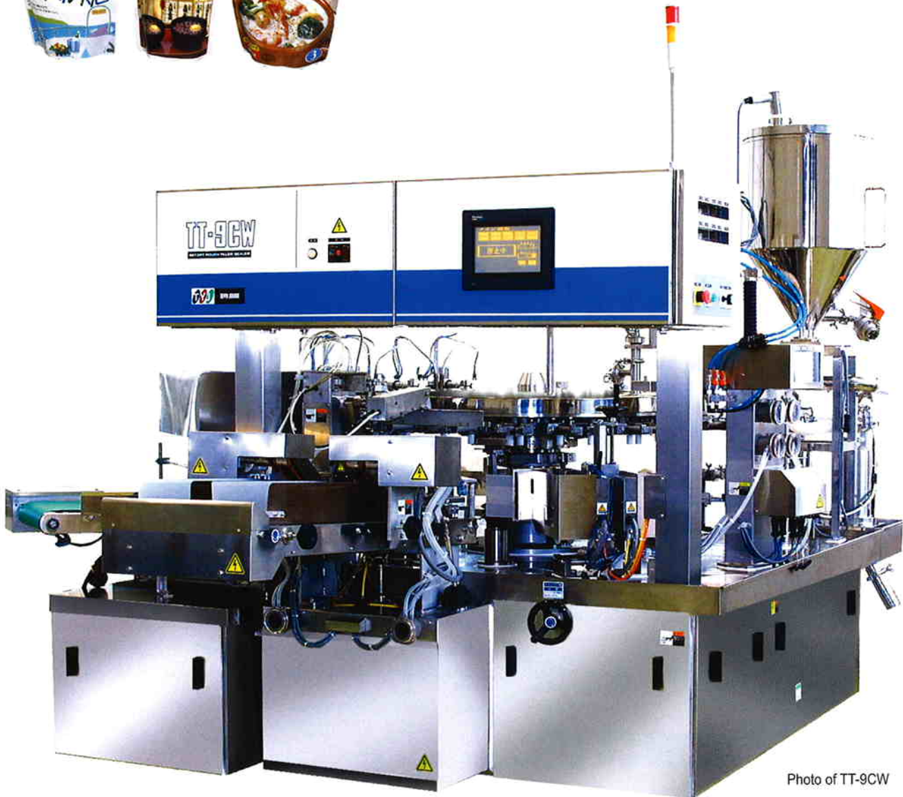
Photo of TT-9CW