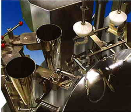
Pouch Opening, Solid Filling

A double action motion for stable pouch opening. Various filling machine can be interlocked.